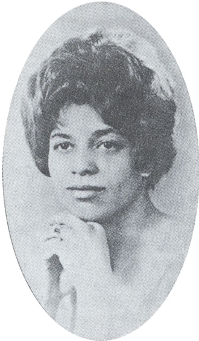
Junior year at Brandeis.