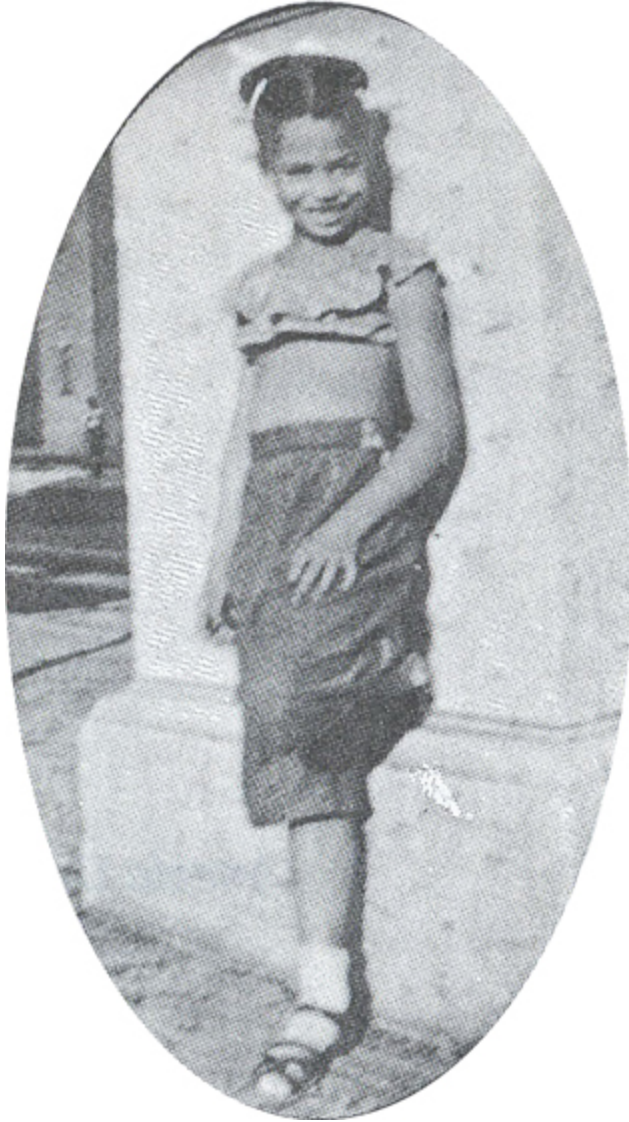
Visiting New York, July, 1951.